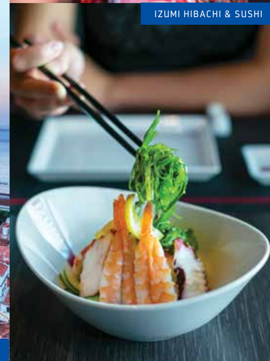
IZUMI HIBACHI & SUSHI